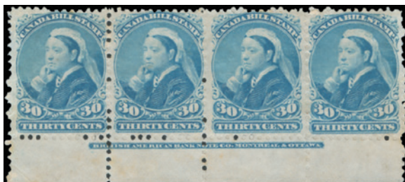
FB49* - 30c blue unused, no gum, IMPRINT STRIP of 4 Higher value imprints rarely seen. Very Fresh - $50 (±US$40)