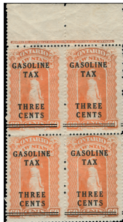
OGT4*NH - GASOLINE TAX IMPRINT BLOCK of 4 THREE CENTS on 60c. usual blue C on gum. stamps only cat $240 - Rare - $175 (±US$140)