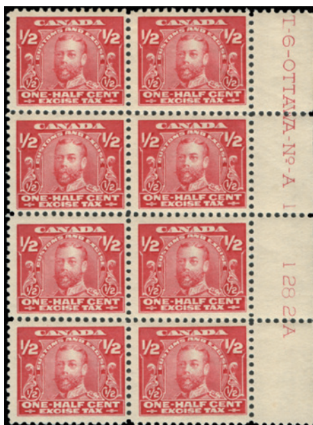
FX2* - 1/2c red. 3 stamps light hinged. rest *NH PLATE BLOCK OF 8 - $25 (±US$20)