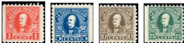
QCP1-4* - 1-25c complete set unused, no gum. Usual centering. The 10c is a very difficult stamp - $55 (±US$44)