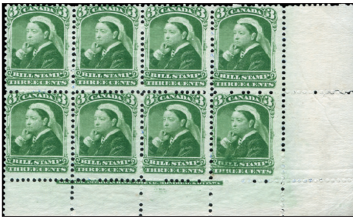
FB40* - 3c green no gum IMPRINT corner block of 8 Nice fresh block - $50 (±US$40)