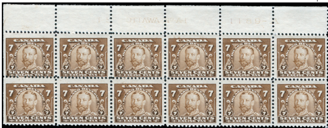
FX4*NH - 7c brown Excise Tax Plate number + "Broken Arrow" Plate number block of 12. Plate "A1". The imprint is in light brown. Cat. value as just single stamps is $336 - $150 (±US$120)