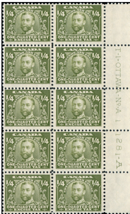
FX1*NH - 1/4c green PLATE BLOCK OF 10 - $25 (±US$20)