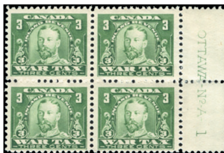
FWT9*NH - 3c green WAR TAX PLATE BLOCK Very fresh - $75 (±US$60)