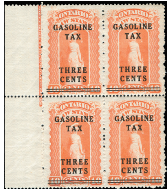
OGT2* - THREE CENTS on 40c GASOLINE TAX IMPRINT BLOCK OF 4. Mint original gum without usual blue C on gum side and very scarce thus. A very attractive block. Just the stamps catalogue $240 + value of imprint block. $200 (±US$160)