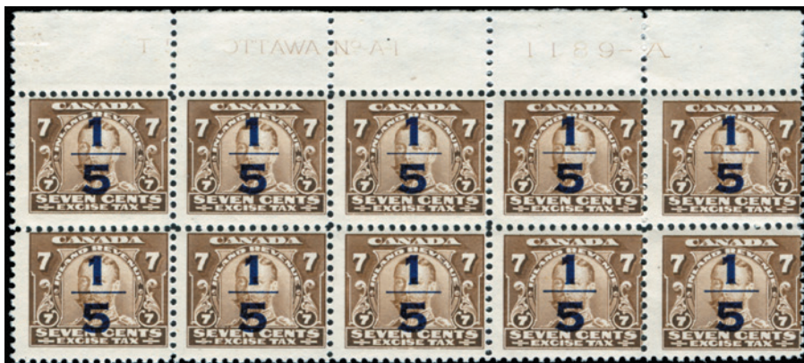
FX22*NH - 1/5 on 7c PLATE Number Block of 10 Plate A1 - $75 (±US$60)