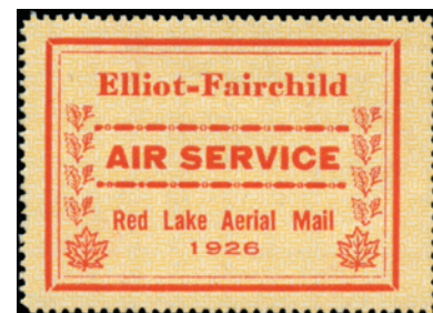
1926 Elliot - Fairchild Air Service. CL8* - 25c mint - slight gum glazing. Very fresh - $30 (±US$24)