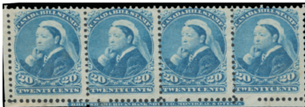
FB48* - 20c blue unused, no gum, IMPRINT strip of 4 Higher value imprints rarely seen. Very fresh. $35 (±US$28)