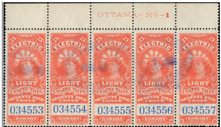
FE12a - 75c vermilion, purple #. Used PLATE number IMPRINT strip of 5. Rarely seen especially in used condition - $45 (±US$36)