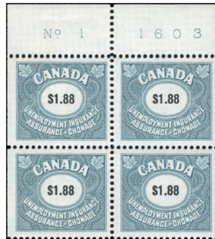
FU82*NH - PLATE BLOCK OF 4 Very Fine. Cat. as just stamps $42.50 $30 (±US$24)