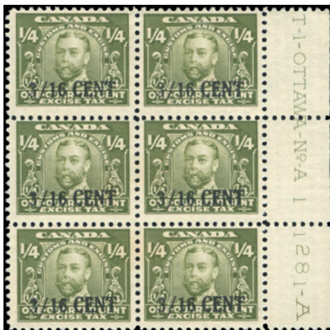
FX21* - 3/16 on 1/4c Plate Block of 6 Unused, no gum - $20 (±US$16)