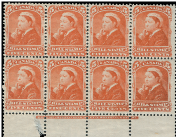
FB42*NH - 5c orange bottom IMPRINT Block of 8. Small fault at bottom. Very fresh and seldom offered - $45 (±US$36)