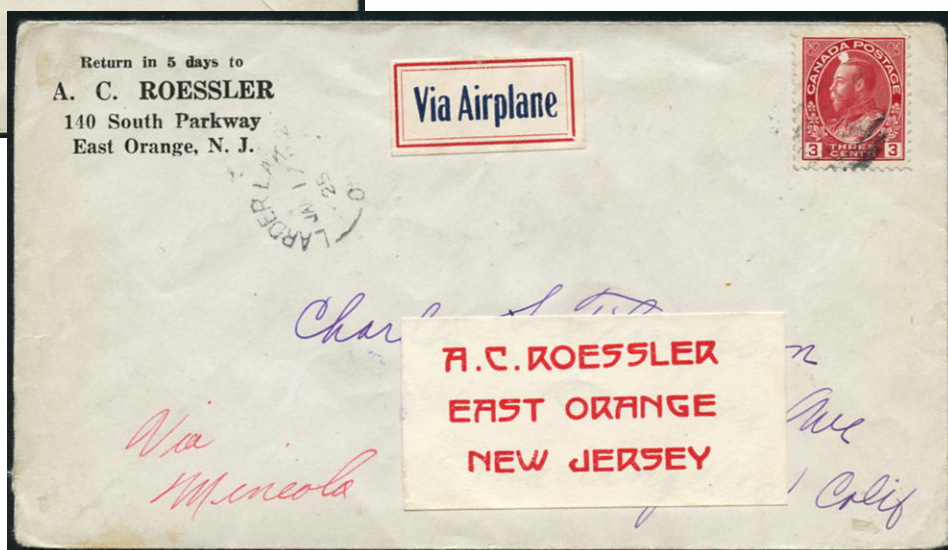
LAURENTIDE AIR SERVICE CL4 - red on Roessler cover. CL4 has edge fault at top right. Larder Lake, Jan 17, 1925 cancels. Rare on cover - $195 (±US$156)