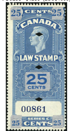
FSC23a - DOUBLE SILVER overprint $325 (±US$260)