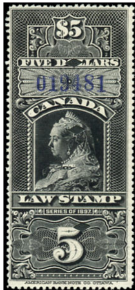
FSC12 - $5 black, purple #. 1897 Law Fresh, just a trace of ironed out document fold - $300 (±US$240)