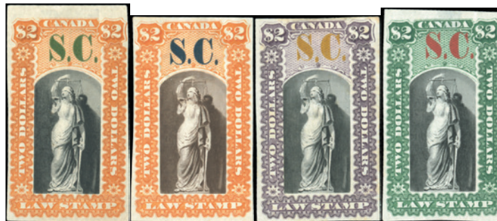
ca. 1864 SUPREME COURT ESSAYS Imperf on india. 4 different colours (blue, black, orange, red) of "S"upreme. "C"ourt. overprints. Rarely offered. EX: W.C. Rocket, Chesapeake collections - $500 (±US$400)