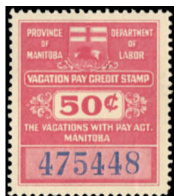
MV11* NH - very rare 50c

I will sell 2 singles at $800 (±US$640) each (reserve your copy now)