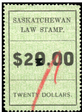
SL32 - Rare $20.00

light document fold at top resulting in tiny closed tear at left. Only 100 printed used at "M"oosemin - $400 (±US$320)