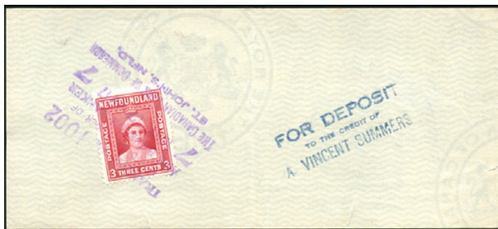
Newfoundland #246 - 3c carmine Royal family issue used as revenue stamp on reverse of 1940's St. John's, Newfoundland Royal Bank of Canada cheque $8 (±US$6.40)