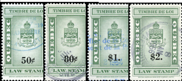
QUEBEC LAW STAMPS QL109 - 116 10c - $2 complete used.

Seldom seen complete used. All have nice light cancels for the issue.