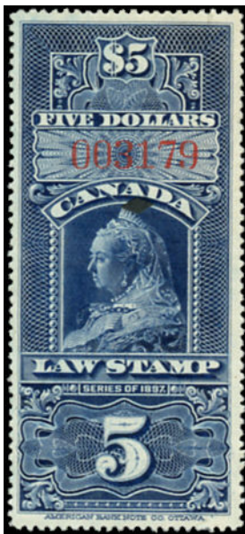
FSC9 - $5 blue 1897 Law stamp VF used for this - rarely seen this nice $50 (±US$40)