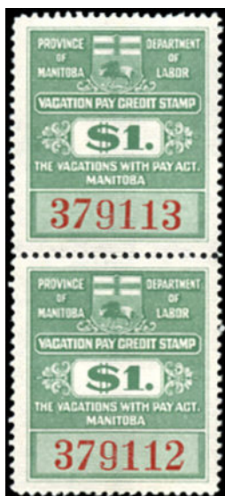
MV12* NH - very RARE $1

OST37, 37a* NH - DOUBLED "CENT" stamp on left. VF* NH . Cat $350 $200 (±US$160)