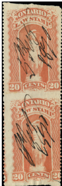
1870 ONTARIO OL48a - 20c vertical pair IMPERF BETWEEN. Very attractive looking pair of the RAREST of the imperf between pairs. Closed tear from above left "20" to below "20" on right does not really affect appearance. Pairs are typically faulty as they were roughly separated. Much rarer than OL52a. Cat. $550 Ex Chesapeake....$300 (±US$240)