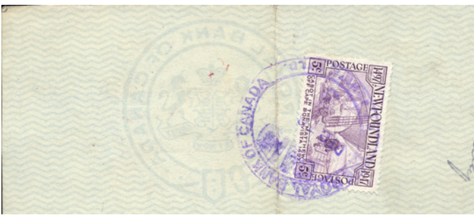
Newfoundland #270 - 5c Cabot issue used as revenue stamp on reverse of 1940's St. John's branch of Royal Bank of Canada. Several similar items available - $15 (±US$12)