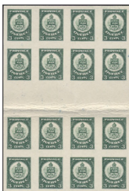
1940 Quebec Tobacco tax. 3c Unlisted PROOF Only 1 sheet ever turned up - all were folded in the gutter between the stamps. No used stamps are known of this issue. Rare gutter block of 16 on card $95 (±US$76)

Order minimum $150 from this #111 internet price list and receive B.C. CANNABIS STAMP at no charge limited quantity available