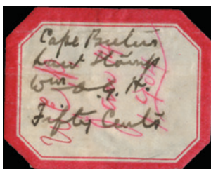
NSC7 - 50c "LAW STAMP" 3 horizontal document bends. VF otherwise. Cat $2500 Rare - $850 (±US$680)