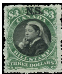
NSB18a* unused, no gum - $3