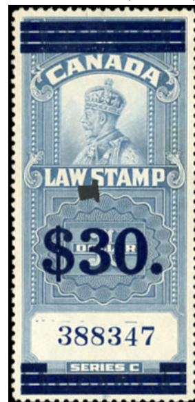
FSC19 - Rare $30 horizontal bar overprint. VF used. Rare $1500 (±US$1200)