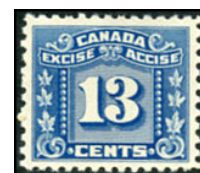
FX73* mint - rare 13c Excise tax.