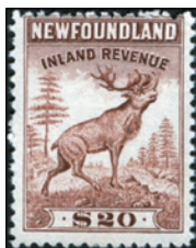
NFR43* - $20 brown 1942 Caribou. perf. 12. unused, no gum. Typical centering. Cat. $175 - $45 (±US$36)