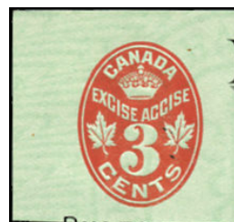
FCH3 unused 3c without "CC" letters. 2 tiny pinholes. A great rarity. $150 (±US$120)