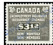
FU105 - rare $3.12 - F/VF used perfs all around - $70 (±US$56)