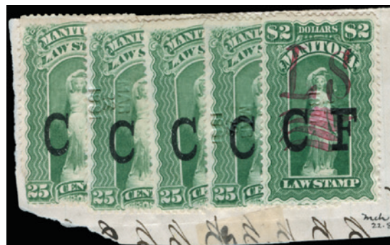
1884 Manitoba Law ML44b - $2 red "L S", CF stroked out + 4 x ML9 on piece. ML44b is A GREAT RARITY especially on piece. Ex: Pitblado, Chesapeake collections. Cat $605 ..... Fabulous - $350 (±US$280)