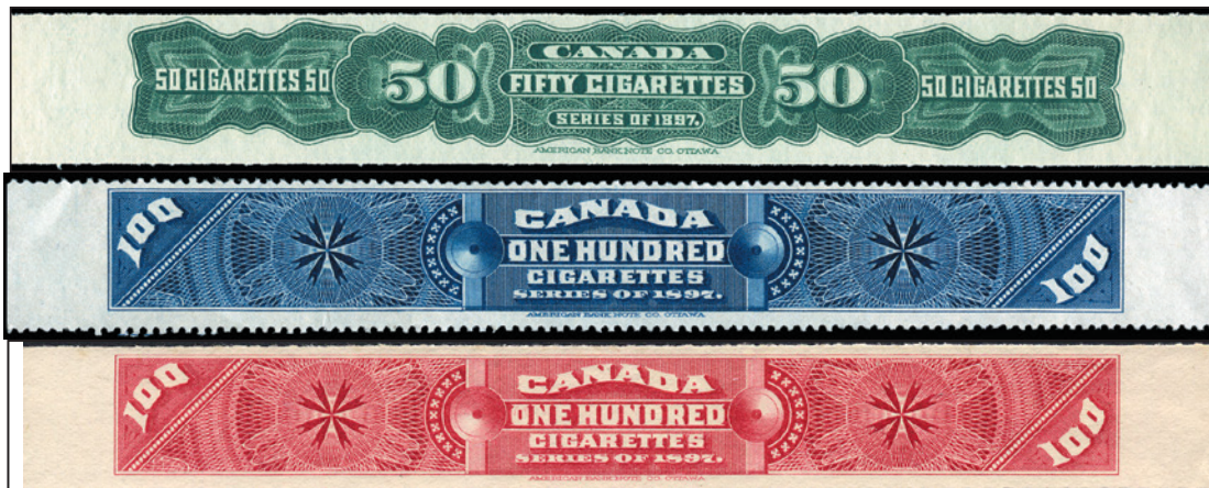
Series of 1897 - Cigarette Stamps - beautifully engraved - unused in Pristine condition.