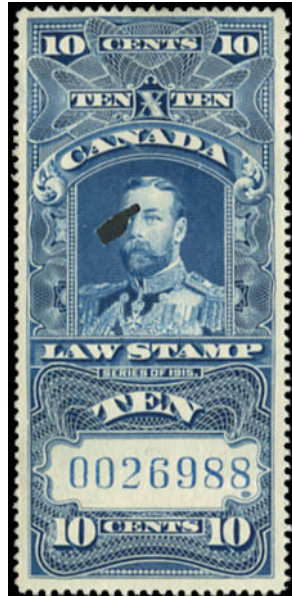
FSC13 - 10c blue 1915 Geo. V. Law light horizontal document fold at top $450 (±US$360)