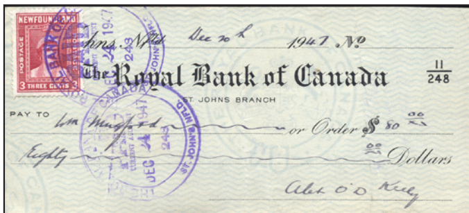
Newfoundland #246 - 3c carmine Royal family issue used as revenue stamp on front of 1940's St. John's, Newfoundland Royal Bank of Canada cheque $10 (±US$8)