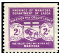
MV2* NH - 2c purple Vacation Pay