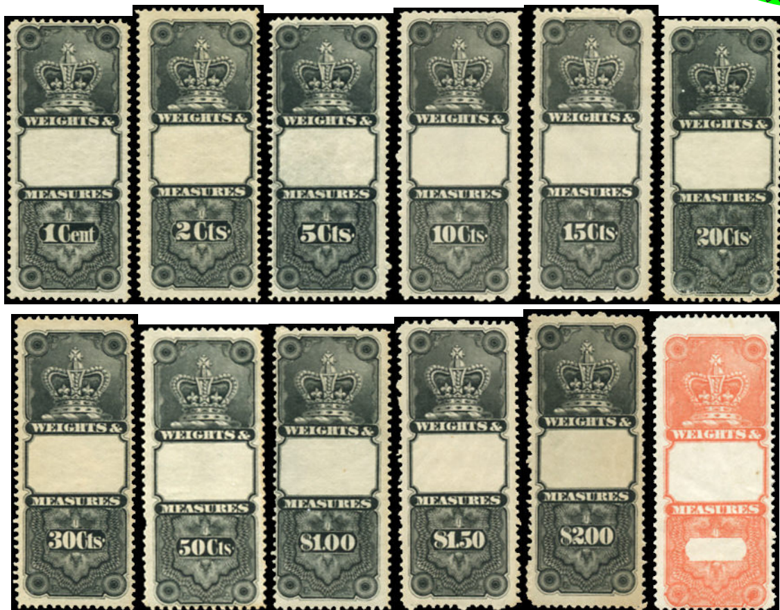
1885 Weights & Measures FWM22 - 33* complete mint mostly lightly hinged set WITHOUT control numbers

Seldom offered complete. Very fresh and clean set - $450 (±US$360)