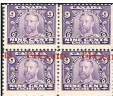
FX28d* unused no gum BLOCK OF 4.