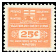
MV10* NH - 25c orange Vacation Pay.