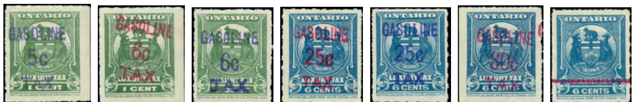
ONTARIO LUXURY TAX - Overprinted "GASOLINE TAX" + New Value.

Seldom offered complete. Very fresh and clean set - $450 (±US$360)