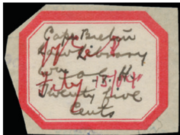
NSC6 - 25c "LAW LIBRARY" on small document clipping. Very Fine used. Cat. $2500 Rare - $1000 (±US$800)