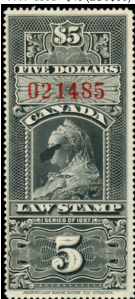
FSC10 - $5 black, red #. 1897 Law Fine used - $800 (±US$640)