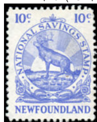
1947 Newfoundland NFW3 - 10c blue. Just a trace of a cancel - $20 (±US$16)