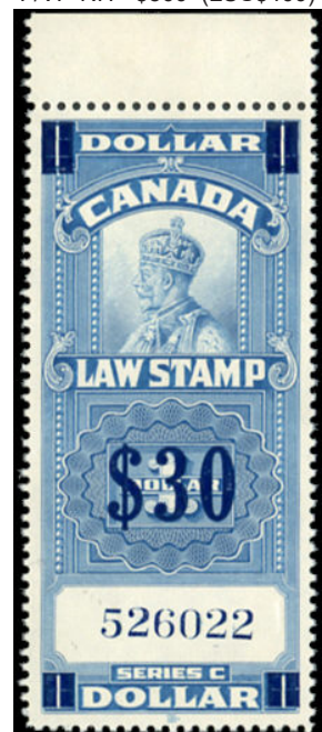
FSC20*NH - UNLISTED Printed on OFF-WHITE PAPER Apparently only 1 sheet of 20 existed FSC20c - $1250 (±US$1000)