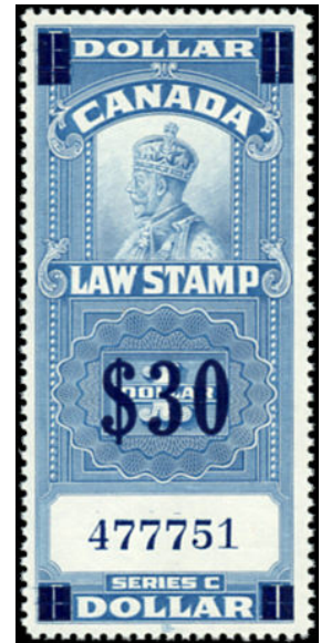
FSC20* NH - $30 on $1 overprint F/VF*NH - $500 (±US$400)