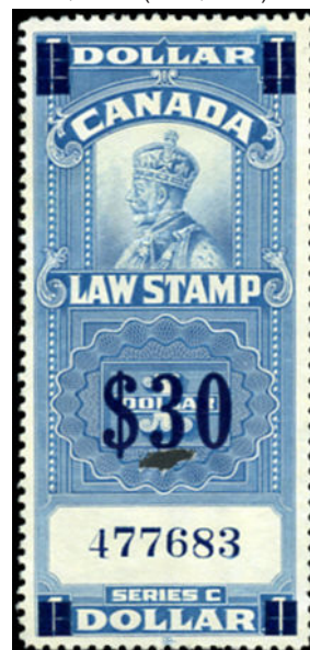
FSC20 - $30 on $1 overprint. almost VF used - $400 (±US$320)