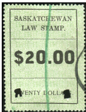
SL32 - Rare $20.00

light document fold at top resulting in tiny closed tear at left. Only 100 printed used at "M"oosemin - $400 (±US$320)