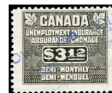
FU105 - rare $3.12 - Fine used perfs all around - $55 (±US$44)