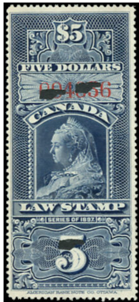
FSC9 - $5 grey blue 1897 Law stamp F/VF used - $45 (±US$36)