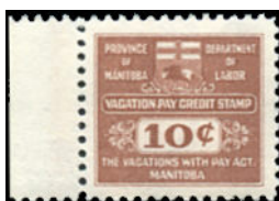
MV9* NH - 10c brown Vacation Pay.