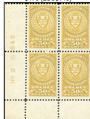
QST14* NH - 50c