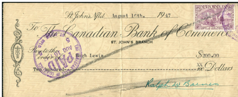
Newfoundland #270 5c Cabot used as revenue stamp on 1947 St. John's, Newfoundland Canadian Bank of Commerce cheque - $20 (±US$16)