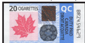
20 cigarettes stamp for use in Quebec province - $5 (±US$4)