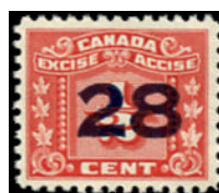
FX131*NH - 28 on 1/2c. Rare and missing from most collections. $135 (±US$108)