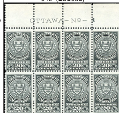
QST13* NH - 20c slate