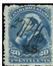
NSB12a - 20c variety