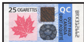
25 cigarettes stamp for use in Quebec province - $5 (±US$4)