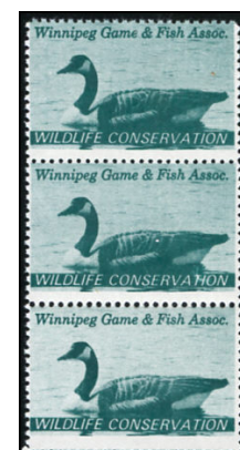
MW1c*NH - Perf variety strip of 3. vertical strip of 3 showing different gauge horizontal perfs. Cat $15 $5 (±US$4)

100 different Canada revenue stamps Hundreds have been sold to collectors & dealers. ±$185 catalog value only.....$50 (±US$40)