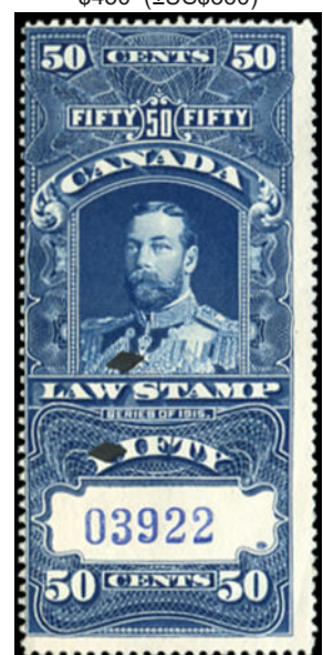
FSC16 - 50c dark blue 1915 Geo. V. used - $150 - (±US$120)