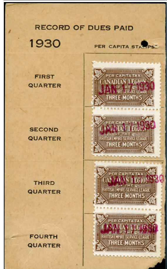
1929 - 1930 CANADIAN LEGION "RECORD OF DUES PAID" card.

This is an actual membership card used by legion members. 1929 dues on 1 side, 1930 on other side. Notice the very different shades of the 1929 & 1930 stamps. 4 singles and 2 pairs for total of 8 stamps. I believe this is the only such card I have seen - $450 (US$360)