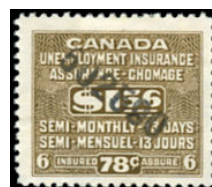
FU35 - $1.56 brown F/VF used Rare value missing from most collections. Perfs all around. Properly cancelled with employer id #. $120 (±US$96)