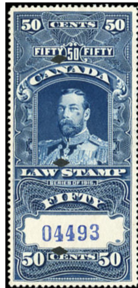
FSC16 - 50c blue 1915 Geo. V. Law VF used - $225 - (±US$180)