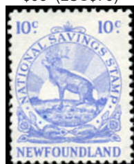
1947 Newfoundland NFW3 - 10c light blue. Just a trace of a cancel - $20 (±US$16)