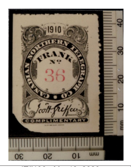
E.S.J. van Dam Ltd - internet price list www.canadarevenuestamps.com - IT#106 - May19, 2020 - page 8