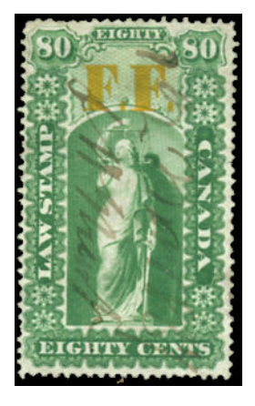
OL24 - Rare 80c used. missing from most collections - \$50 \text{ (US}\pm\$40)