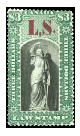
OL43d* no gum - $3 L.S. very well centered for this value - $95 (US±$76)