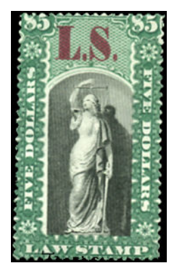
OL45c* no gum $5 L.S. fresh and quite well centered - $70 (US±$56)