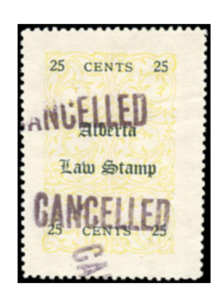
AL8c, e - 25c - scarce "2.5" variety at bottom left as well as small "2" in "25". Very Fine used. Perfs all around. Unlisted in catalog in this combination. $95 (±US$76)