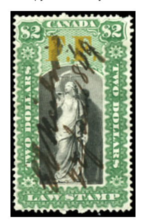
OL27 - very rare $2 used Very fresh copy - $150 (US±$120)