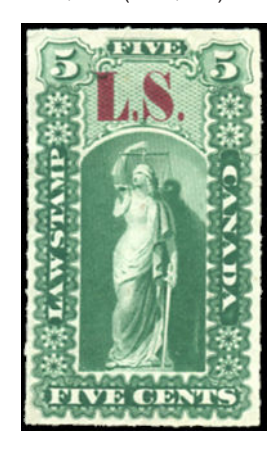
OL31* no gum rare 5c ROULETTED, red L.S. missing from most collections. Very Fine - $150 (US±$120)