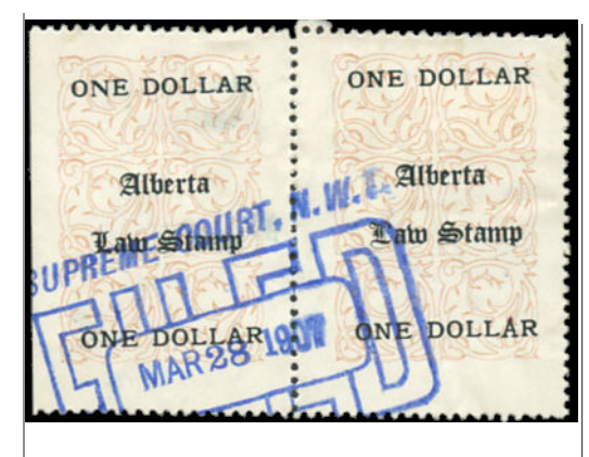
AL16 normal + AL16L Fancy "L" in RARE pair. Additionaly very scarce "Supreme court N.W.T. Mar 28, 1907" cancel. Combination pair of normal stamp + Fancy "L" rarely seen - $95 (±US$76)

Cat. value will be at least $250 + unlisted varieties. $150 (±US$120)