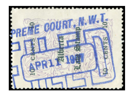
AL1 - 10c green on purple with very scarce "SUPREME COURT N.W.T. Apr 11, 1907" cancel. VF used - $50 (±US$40)