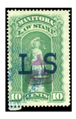
1885 Manitoba - ML50 - 10c CF on LS. Nice clear strike and very fresh. Cat. $375 Ex Pitblado - $195 (±US$156)