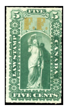
OL16* - Rare 5c rouletted "F.F." unused, no gum. Missing from most collections $75 (±US$60)