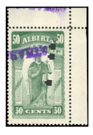
AL21 - 50c Spectacular corner margin copy with scarce "ATHABASCA" cancel. $15 (±US$12)