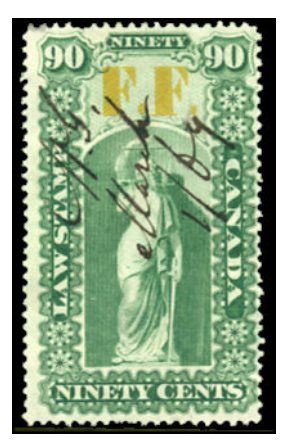
OL25 - very rare 90c used. Beautiful fresh copy of this rarity - $150 (US±$120)