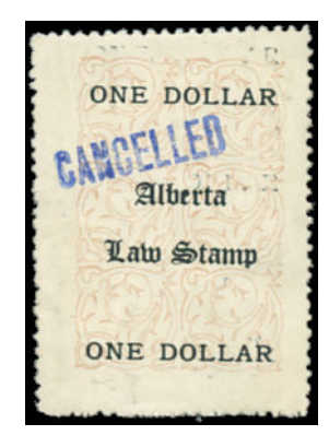
AL16c - ONE DOLLAR PINPERFORATED at left and bottom. Slight doubling of "ONE DOLLAR" at top. Cat $250 $150 (±US$120)