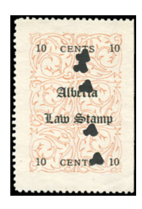
AL4a - 10c black with BROWN background. Faint natural paper bend bottom right. Rarely seen, much undervalued in 2017 catalogue. $35 (±US$28)