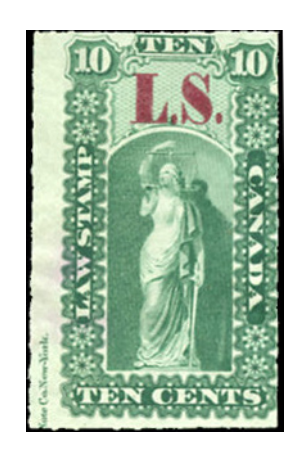
OL32 - rare 10c ROULETTED partial "American Bank Note Co. New York" imprint $75 (US±$60)