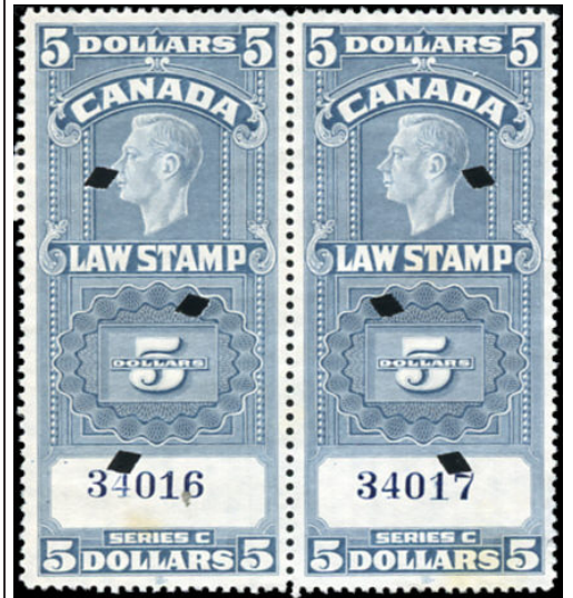
FSC26a - $5 slate genuinely used pair. $5 values seldom seen. Multiples are quite rare. Cat $100 - $65 (±US52)