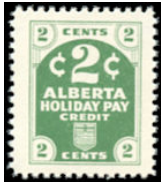
AV10*NH - 2c Alberta Vacation Pay. Mint never hinged - rarely seen. Cat. $30 $21 (±US$16.80)