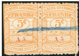
AT1, 1a - 5c pair - Alberta Telephone Frank An unusual pair with unwatermarked stamp on left and WATERMARKED stamp on right. Not an easy stamp to find. Cat. $85+ .. $60 (±US$48)