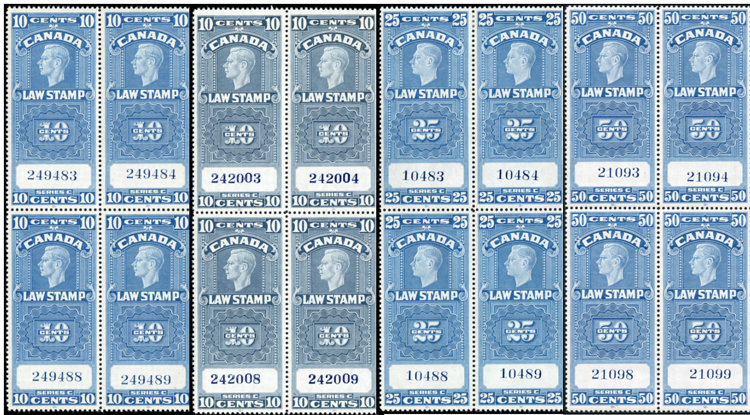
King George VI Law stamps - FSC21, 21a, 24, 25 - 10c blue, 10c slate, 25c blue + 50c blue BLOCKS OF 4.

FLS2 - ½ booklet pane cat. $150 - VERY FINE single - $100 (±US$80)