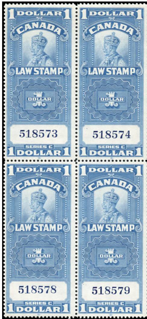
FSC18*NH - $1 blue George V block of 4. Very attractive mint never hinged Block of 4. Cat. $198+ - $150 (±US120)