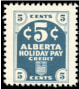
AV11*NH - 5c Alberta Vacation Pay. Mint never hinged - rarely seen. Cat. $30 $21 (±US$16.80)