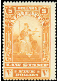
AL38* - Rare $5 yellow orange This is a great rarity. It is believed only 100 copies were produced. I have seen just a few in 50 years. Cat $400.....$300 (±US$240)