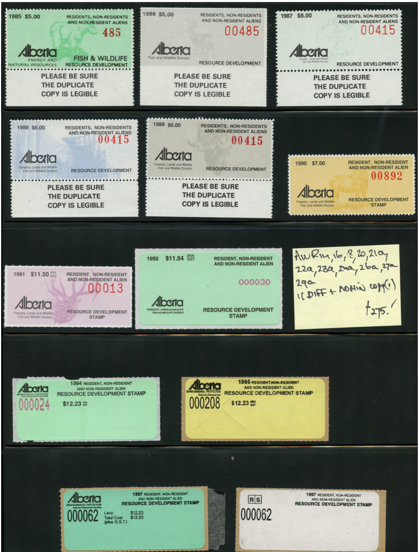
Alberta Resource Development stamps - 11 different + 1 administration copy.

Rarely offered AWR14,16,18, 20, 21a, 22a, 23a, 24a, 26a, 27a, 29a + 29a administration copy. Largest lot I have seen in some time.