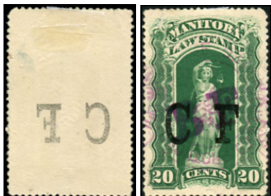
ML70 - 20c BF on CF with major variety very strong "C F" on back. . small closed tear, tiny thin Unlisted $75 (±US$60)