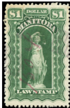
ML113b - $1 green Watermarked Spectacular copy - $60 (±US$48)