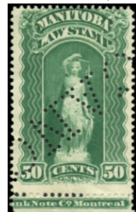
ML107 - 50c with imprint - $25 (±US$20)