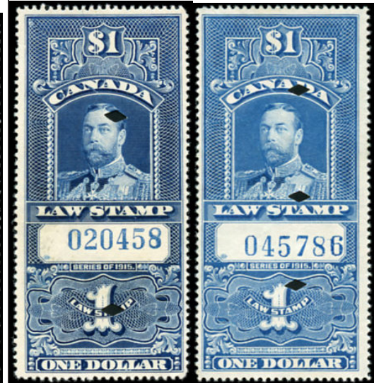
FSC17a - $1 1915 George V law stamps. 2 different very distinct shades of dark blue and light blue. Very striking nice fresh copies. $120 (±US$96)