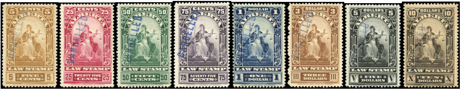
1910 - 30 Alberta Law stamp Specimens. Each stamp is handstamped "CANCELLED" and is still completely mint never hinged. Included are all items shown AL27, 30, 31, 32, 33, 35, 37, 39 - 5c/$10. Very fresh and attractive. Cat. value as mint singles $432 $250 (±US$200)