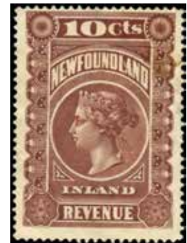
NFR2* - 10 brown 1898 Queen Victoria. mint, traces of original gum. $130 (±US$98)

Very Fine condition. This is item 14036 on my website and priced at $695 - 10%. Save now Buy from this ReveNews newsletter for only $550 (±US$413)