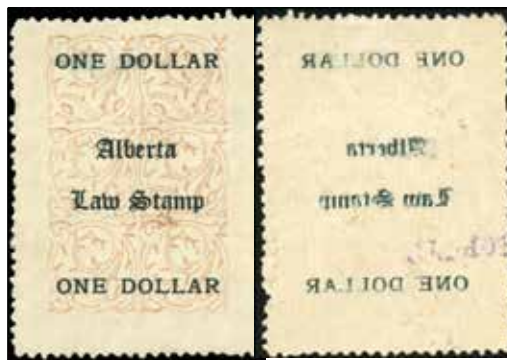
AL16c* - $1 DOLLAR PINPERF + FULL OFFSET on back. mint, part original gum. $200 (±US$150)