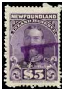
Newfoundland Inland Revenue NFR21d - $5 purple, perf. 12 Variety without period after "OTTAWA" Catalog value $350 $175 (±US$132)