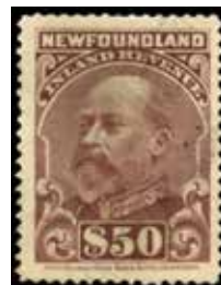
Newfoundland 1907 King Edward VII NFR14 - $50 violet brown. Very Fine used for this with a very light cancel - $450 (±US$338)