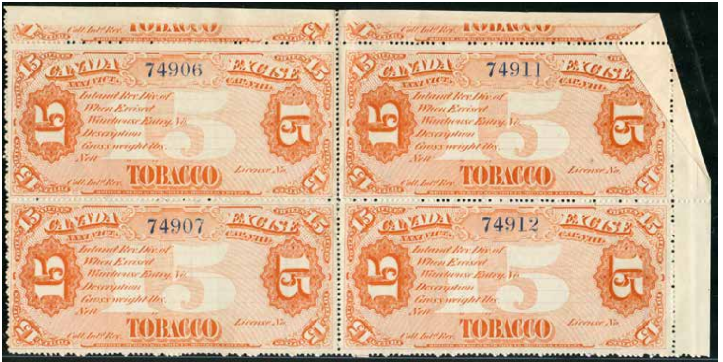
RM45 - M278 - 15 Pounds red Tobacco upper right corner margin block of 4 with SPECTACULAR PRE-PRINTING FOLD OVER. Stamps are on thick wove Watermarked paper. Division is open. 5mm control numbers. Very Fine mint, no gum as issued. Spectacular Exhibition Piece. - $150 (±US$113)