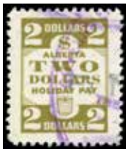
Alberta Vacation Pay AV16 - $2 unpunched Very Fine used $60 (±US$45)