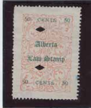
Pos. 10, Type D

Pos. 10 has perfs on all sides and break in "N" on lower CENTS