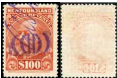
Newfoundland Inland Revenue NFR15 - $100 perf. Nice offset on back. Cat $350 $200 (±US$150)