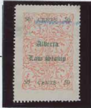
Pos. 4, Type D

Pos. 4 is perforated on left and has no damaged "O" at lower left