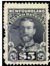
NFR21b - $5 perf. 11 x 12. Cat $175 Nice fresh copy $110 (±US$83)