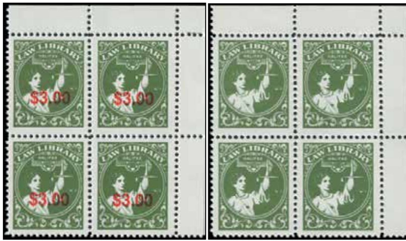
NSH13 normal with $3.00 overprint