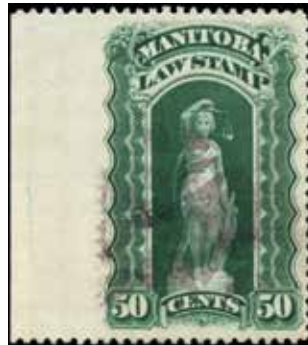
ML112d - 50c green huge imperf margin at left. Ex: Pitblado. Very Fine used Cat. $350 - $225 (±US$169)