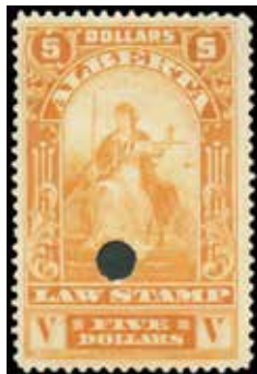
AL38* - rare $5 yellow orange possibly a specimen because of round punch. Cat $400 - $250 (±US$188)