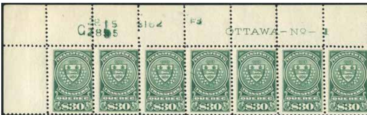
1913 QUEBEC BILINGUAL STOCK TRANSFER - QST18*NH - $30 green upper margin imprint strip of 7 Minor separation in selvage as is to be expected - the strip is 112 years old. Catalogue value is $963 + value of the imprint. Possibly unique imprint strip - $475 (±US$357)

SPECIAL OFFER - PURCHASE BOTH IMPRINT BLOCKS AS SHOWN ABOVE FOR only - $700 (±US$525)