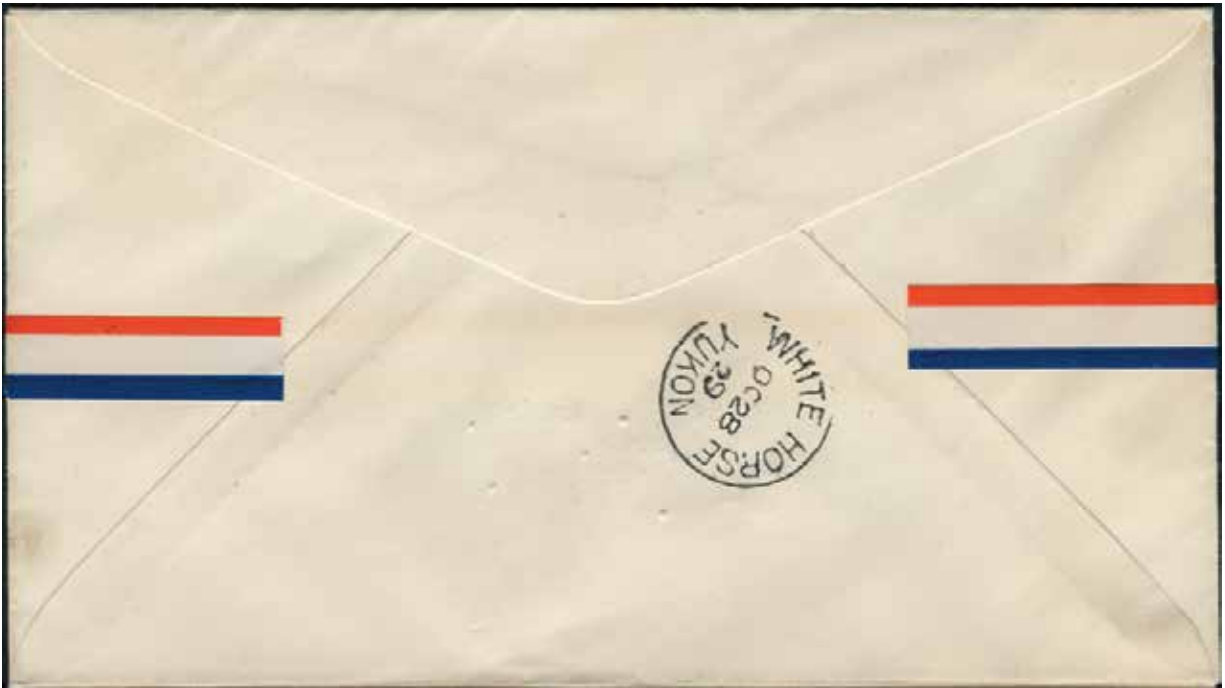
YA2931 - CL42 Yukon Airways October 28, 1929 - Rare - Atlin to Whitehorse flight. see page 115 - Volume 4 - 7th edition (latest) of the American Air Mail catalogue states "All known mail from the company flown in the fall of 1929 should be considered rare" Cat - $250 $150 (±US$120)