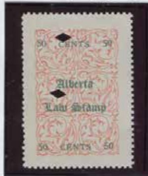
Pos. 11, Type B

Fancy "L" on Pos. 5, 10 & 12 Pos. 12 Damaged "N" on top CENTS & perfed a bottom