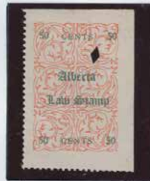
Pos. 3, Type D

Pos. 4 is perforated on left and has no damaged "O" at lower left