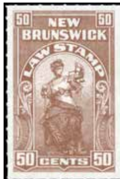
NBL21*NH - 50c brown rouletted Very Fine mint never hinged. Very rare $150 (±US$113)