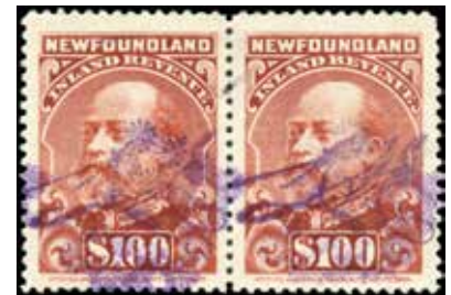
1907 Newfoundland NFR15a - $100 Very Rare horizontal pair.

Very Rare multiple in very nice condition. Cat. value $700+. This is item 535 on my website priced at $495 minus 10% discount. Save Now and buy from this ReveNews newsletter for only $400 (±US$300)