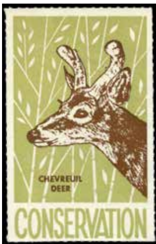
QFG11* - Quebec Conservation unused, no gum. pinhole, Very Fine appearance $95 (±US$72)