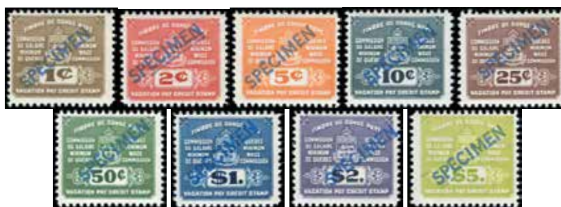
1958 QUEBEC VACATION PAY COMPLETE with "SPECIMEN" overprint. 1c - $5 complete mint never hinged. Set without overprint catalogs $699.75 - A bargain at $150 (±US$113)

SPECIAL OFFER - PURCHASE BOTH IMPRINT BLOCKS AS SHOWN ABOVE FOR only - $700 (±US$525)