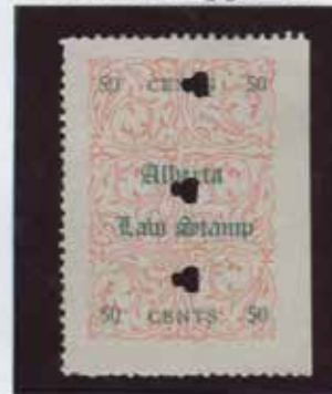
Pos. 6, Type D