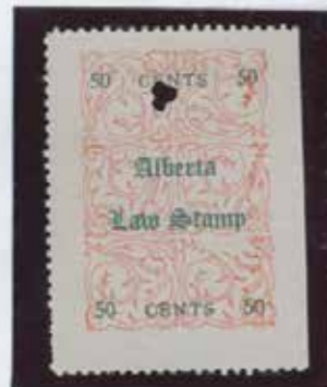
Pos. 9, Type E

Pos. 9 6th back-ground block is broken at top