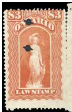
ONTARIO 1870-1911 OL59 - $3 red variety part IMPERF ON RIGHT due to pre-printing fold - $125 (±US$94)