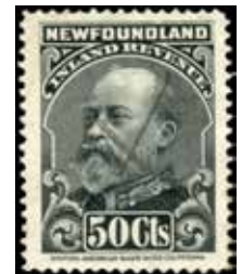
Newfoundland 1907 King Edward VII NFR11 - 50c black, well centered with light pen cancel. $120 (±US$90)