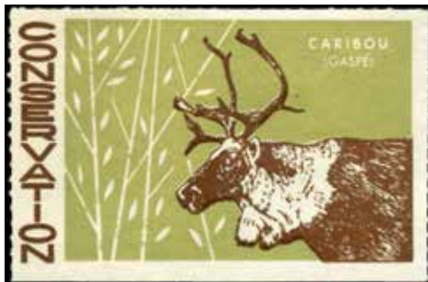
QFG12* - Quebec Conservation unused, no gum. Very Fine $125 (±US$94)