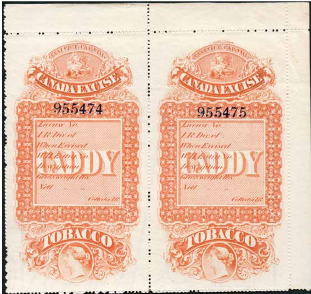
RM68b - M150 - 1871 CADDY Tobacco stamp. Block Watermark on wove paper. Multiples rarely seen. Pristine mint, no gum as issued. - $125 (±US$94)