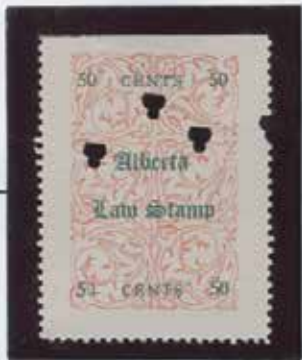
Pos. 1, Type D

Pos. 1 is perforated on left and has a damaged "O" at lower left