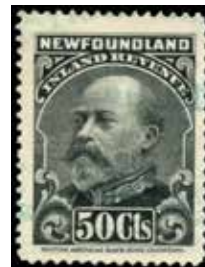
Newfoundland 1907 King Edward VII NFR11 - 50c black, well centered with very light cancel. An exceptional copy for this value $150 (±US$113)