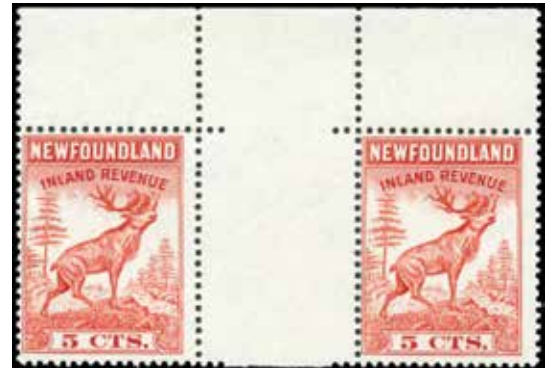
Newfoundland 1966 Caribou NFR46a*NH - 5c red top sheet margin gutter pair. Beautiful fresh condition - $15 (±US$12)