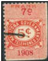
Manitoba Government Telephone MT1 - 1908 - 5c red. A very difficult stamp missing from most collections $125 (±US$94)