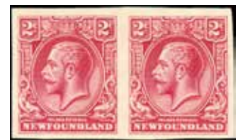
2c red Newfoundland King George V Essay IMPERF PAIR.

Very Fine condition. This is item 14036 on my website and priced at $695 - 10%. Save now Buy from this ReveNews newsletter for only $550 (±US$413)