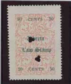
Pos. 5, Type C