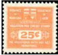
Manitoba Vacation Pay MV10*NH - 25c orange $200 (±US$150)