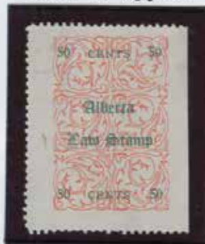
Pos. 12, Type D

Fancy "L" on Pos. 5, 10 & 12 Pos. 12 Damaged "N" on top CENTS & perfed a bottom