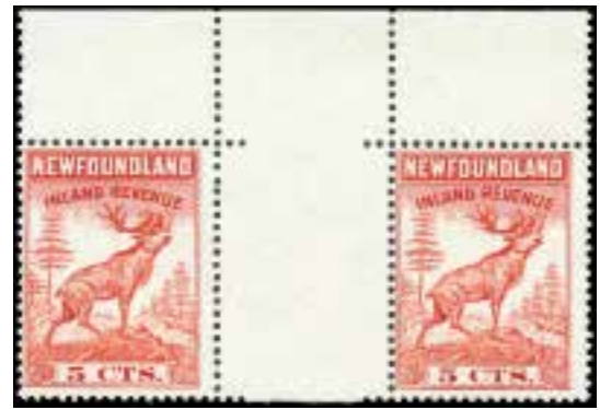
Newfoundland 1942 Caribou NFR36a*NH - 5c red top sheet margin gutter pair. Beautiful fresh condition - $150 (±US$113)