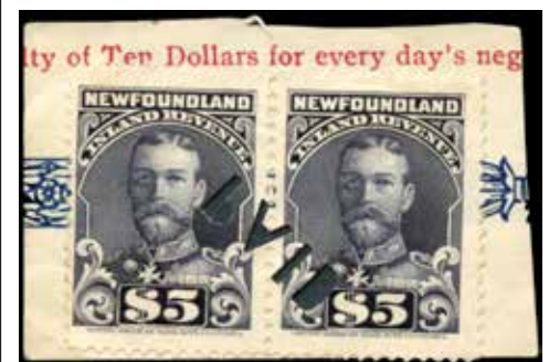
1910 King George V NFR21a - $5 pair, p.11 on piece showing the complete "PAID" cancel. A great addition to any Newfoundland cancel or perfin collection. Cat $150+ $90 (±US$68)

Very Rare multiple in very nice condition. Cat. value $700+. This is item 535 on my website priced at $495 minus 10% discount. Save Now and buy from this ReveNews newsletter for only $400 (±US$300)