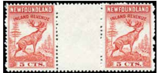
Newfoundland 1942 Caribou NFR36a*NH - 5c red gutter pair. Beautiful fresh condition - $150 (±US$113)