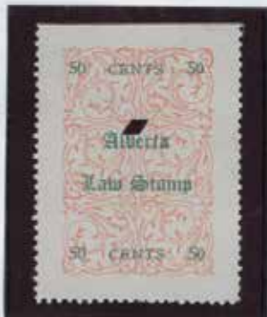
Pos. 2, Type D

Pos. 2 has no clipped Serif on "N", top CENTS