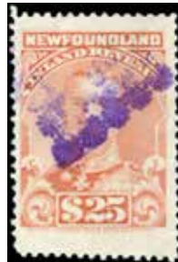
NFR23 - $25 salmon, perf. 12 $150 (±US$113)