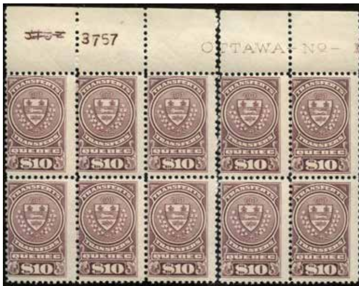
1913 QUEBEC BILINGUAL STOCK TRANSFER - QST17*NH - $10 purple upper margin imprint block of 10. The block actually consists of a block of 6 on the left and block of 4 on the right as can be clearly seen on the scan. The $10 value is a difficult stamp to find in mint never hinged condition. Here there are 10 *NH stamps + imprint. Catalogue value is $605 + value of the imprint. Very Rare - $325 (±US$244)