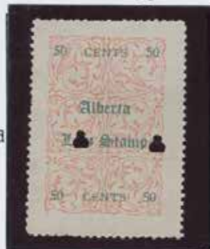
Pos. 7, Type D

Pos. 8 has clipped Serif on "N" on top CENTS