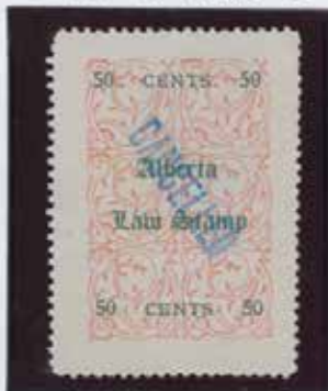
Pos. 8, Type A

Pos. 8 has clipped Serif on "N" on top CENTS