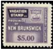
New Brunswick Vacation Pay NBV8*NH - $5 purple about VF - $150 (±US$113)