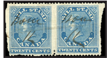
FB11a - 20c blue, perf. 12½ x imperf HORIZONTAL PAIR - IMPERF BETWEEN

A great rarity. Believed to be unique - $3000 (±US$2400)