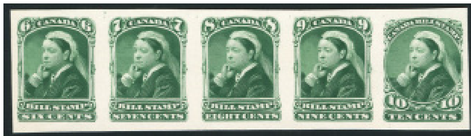
FB43-47P - green Compound Proof Strip of 5 different values 6c - 10c from the composite Proof Sheet on card. Pristine condition. The full proof sheet is pictured in "Boggs" on page 223. This is the only such compound Bill stamp revenue proof I am aware of. Ex Rockett, Chesapeake, etc. Believed to be Unique - .....$3500 (±US$2800)