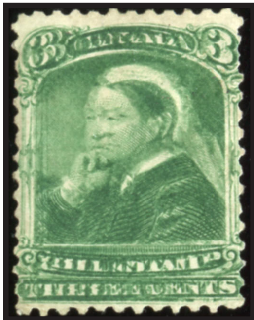
FB40d - 3c green SPECTACULAR DOUBLE PRINT THIS IS THE ONLY KNOWN COPY . You have to see it to believe it. UNIQUE - $3000 (±US$2400)