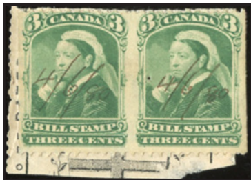
FB40f - 1868 Third Bill issue - 3c green horizontal pair IMPERF BETWEEN on small clipping. tiny pinhole. Ex Rockett, Chesapeake, etc. The only known pair. UNIQUE - $2500 (±US$2000)