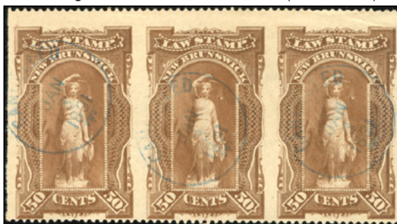
NBL7b - 50c brown horizontal strip of 3 IMPERF BETWEEN.

This is one of 2 copies known. A few tiny pinholes at left.. One of the greatest rarities. Catalogue value $25,000 .... $15,000 (±US$12,000)