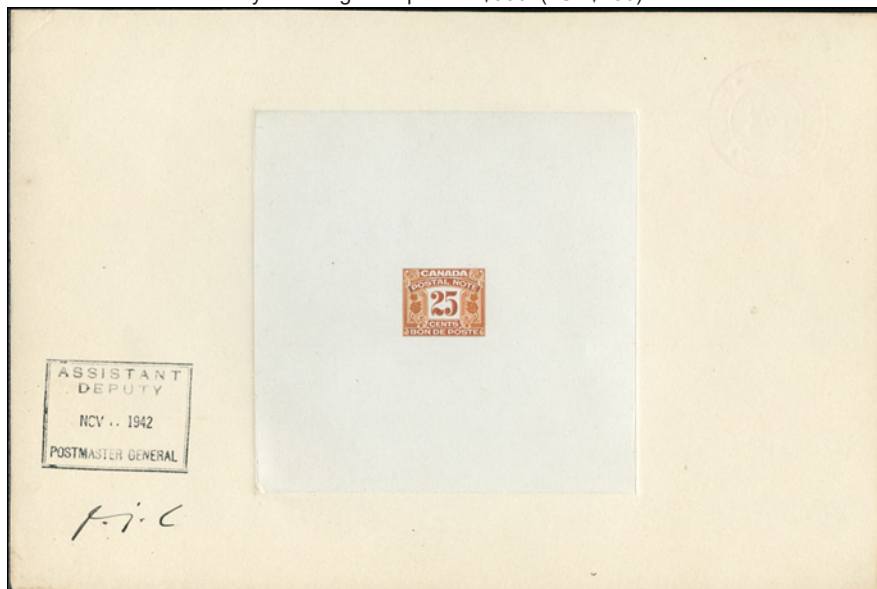
FPS14 - 25c orange LARGE DIE PROOF die sunk on card On the back purple rectangular stamped "C.B.N.Co. Ottawa, Nov 7, 1942 Engraving Dept." + circular stamped "Canadian Bank Note Co. Ltd Ottawa, Nov 17, 1942" in red + initials. On front unusual rectangular stamped "Assistant Deputy Postmaster General, nov 1942" + his initials. Much rarer than the proofs without the stamped Assistant deputy on the front Very Fine large Die proof - $350 (±US$280)