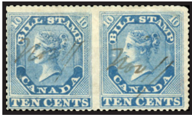
FB10b - 10c blue, perf. 12½ x imperf HORIZONTAL PAIR - IMPERF BETWEEN

Beautiful fresh used pair. A few small pinholes as is so typical for this issue due to documents being pinned together. Staples hadn't been invented at that time. Revenue stamps were often placed in upper left hand corner of notes and documents thus tiny pinholes if they were "pinned" together.