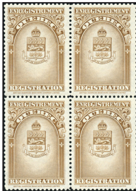
QR37*NH Block of 4 - VALUE OMITTED

Just recently I learned a most interesting story about the reason for this particular stamp.