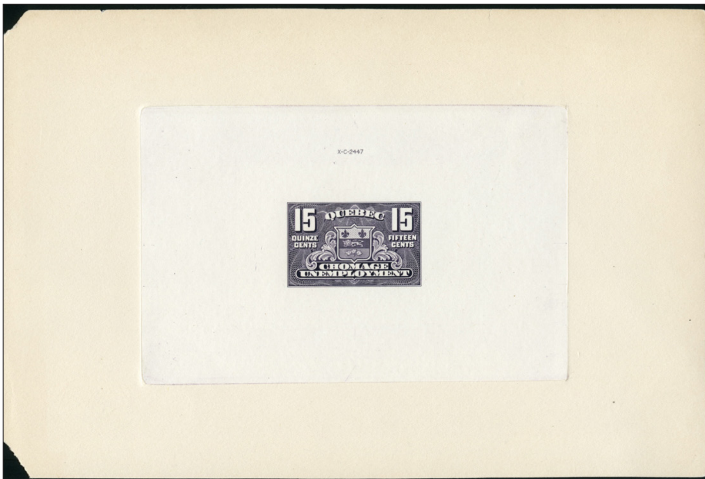
QU3 - 15c Unemployment LARGE DIE PROOF on card with DIE # at top. Die proofs of this issue rarely seen - $500 (±US$450)