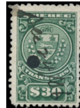
QST8 - The rare $30 green

Nice fresh used copy with "Feb 13, 1907" cancel. Missing from most collections - very Rare. Cat. $1000 $700 (±US$560)