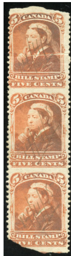
FB42a - UNIQUE - 1868 Third Bill issue. 5c orange vertical strip of 3 IMPERF BETWEEN . Horizontal pre-printing paper crease in top stamp resulting in unprinted blank horizontal line as clearly visible in image. Ex Rockett, Chesapeake, etc. UNIQUE - $4500 (±US$3600)