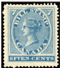
FB7a - perf. 12½

Beautiful fresh pair with full original gum and just a trace of a hinge - $800 (±US$640)