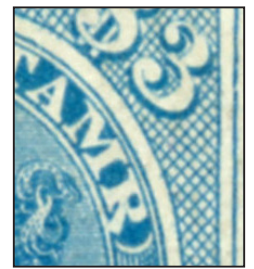
FB17b* - $3 variety "R" for "P" in "STAMR" Nice fresh clean copy, unused, no gum. perf 12½. Couple slightly short perfs at left. Cat $650 $350 (±US$280)