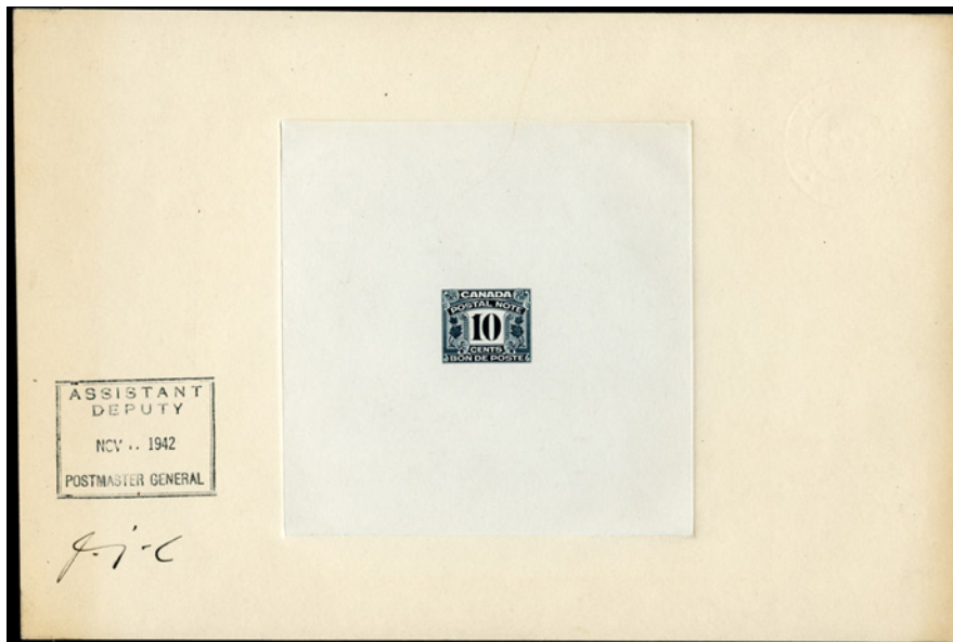
FPS10 - 10c black LARGE DIE PROOF die sunk on card On the back purple rectangular stamped "C.B.N.Co. Ottawa, Nov 7, 1942 Engraving Dept." + circular stamped "Canadian Bank Note Co. Ltd Ottawa, Nov 17, 1942" in red + initials. On front unusual rectangular stamped "Assistant Deputy Postmaster General, nov 1942" + his initials. Much rarer than the proofs without the stamped Assistant deputy on the front Very Fine large Die proof - $350 (±US$280)