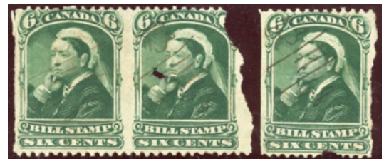
FB43b - 1868 Third Bill issue - 6 green horizontal pair IMPERF BETWEEN + single imperf vertically . Right stamp in pair has small hole just to left of Queen's chin, single has small thin and fault at bottom. Ex Rockett, Chesapeake, etc. Believed to be UNIQUE ... $1750 (±US$1400)