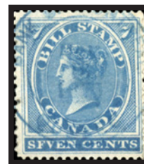
FB7a - perf. 12½ x 13½