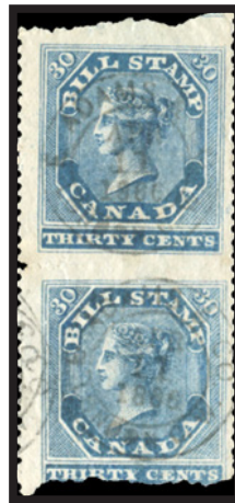
FB12a - 30c blue vertical pair, IMPERF BETWEEN.

One or two copies known - I have yet to see the other copy - $1800 (±US$1440)