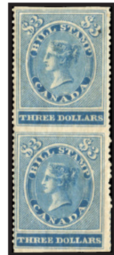
FB17a* - $3 blue, perf. 12½ VERTICAL PAIR - IMPERF BETWEEN

Believed to be unique - $2250 (±US$1800)