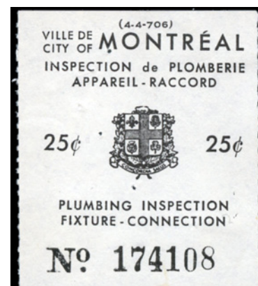
QMP1 - 25c Montreal plumbing inspection stamp.

Lovely fresh pair with very light horizontal document bend at top through "Quebec". Very Rare pair. Cat $1500 $800 (±US$640)