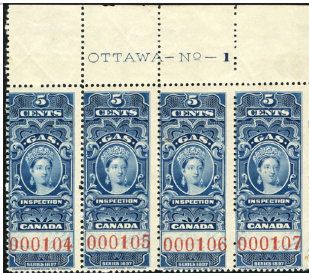
FG17*NH - 5c 1897 Queen Victoria Gas Inspection PLATE NUMBER strip of 4.

SATISFACTION GUARANTEED OR MONEY REFUNDED