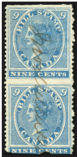
FB9a - Rare 9c blue - Imperf x perf 12½ VERTICAL PAIR IMPERF BETWEEN

Believed to be unique - $2500 (±US$2000)