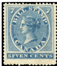
FB7a - perf. 12½ x 13½