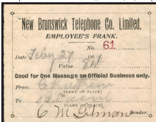
NBF1 - 1907 NEW BRUNSWICK TELEPHONE COMPANY EMPLOYEE'S FRANK

3 stamps have small thins. 1 stamp without faults and NH. Cat. value as just stamps $27,000 Incredible Showpiece believed to be UNIQUE .....$12,500 (±US$10,000)