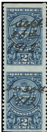
QST1a - 2c blue vertical pair IMPERF BETWEEN.

Fresh used copy, shallow thin, small perf fault at right. Missing from most collections - very Rare. Cat $1000 $500 (±US$400)