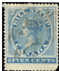
FB7a - perf. 13½