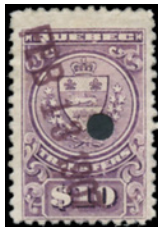
QST7 - The rare $10 purple

Stock item #2771 on my website priced at $8000 - Capex Special - $6000 (±US$4800)