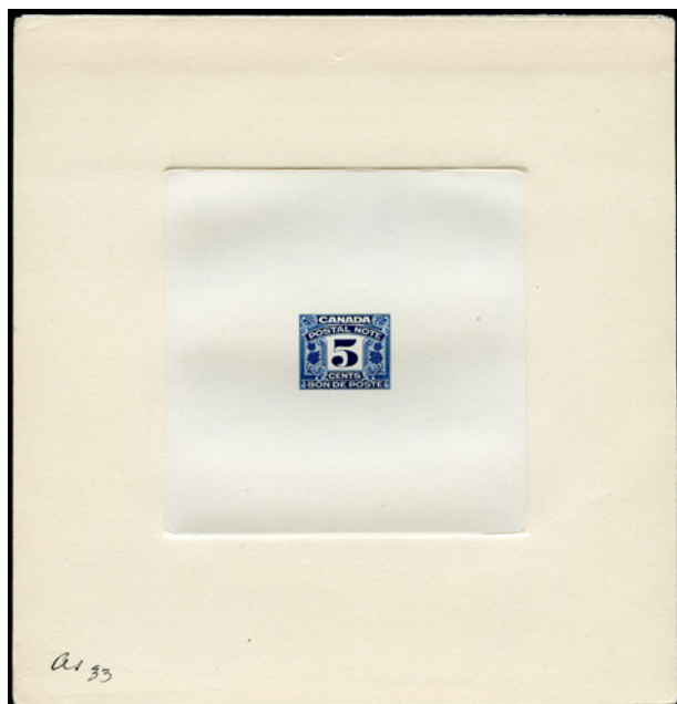
FPS7 - 5c blue DIE PROOF die sunk on card On the back "C.B.N.Co. Ottawa, July 19, 1932 Engraving Dept." + initials. Very Fine $250 (±US$200)