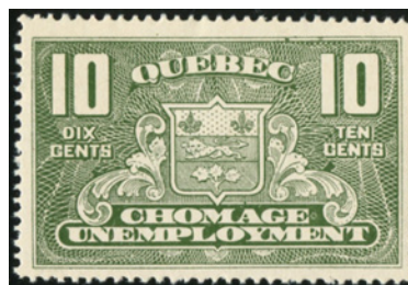
QU2 bootlegger forgery