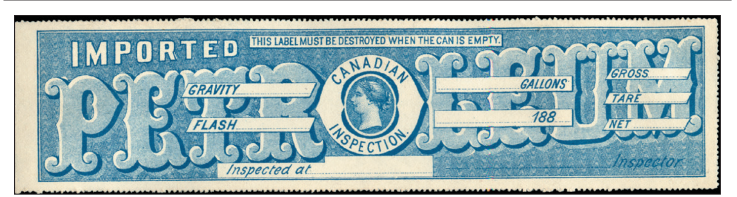
FPL2* - blue, perf. 121 /2. Superb mint. Issued without gum. An extremely rare stamp. Spectacular condition. $950 (±US$760)