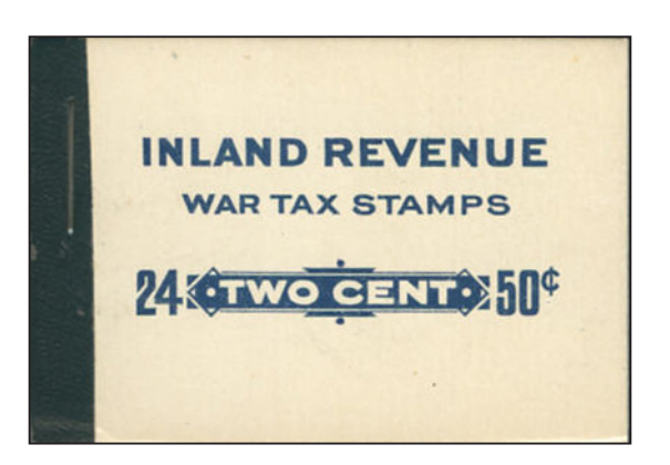
FWT8e *NH complete booklet with 4 booklet panes of 2c brown WAR TAX. Fine mint never hinged with green binding. Cat. $150 - $70 (±US$56)

Additionally there is a scarce Victory bond label affixed as well as 2 x 2c postage due stamps to collect 4c postage due as noted in special rubber stamp. A very attractive and unusual cover. Nice and clean - $65 (±US$52)