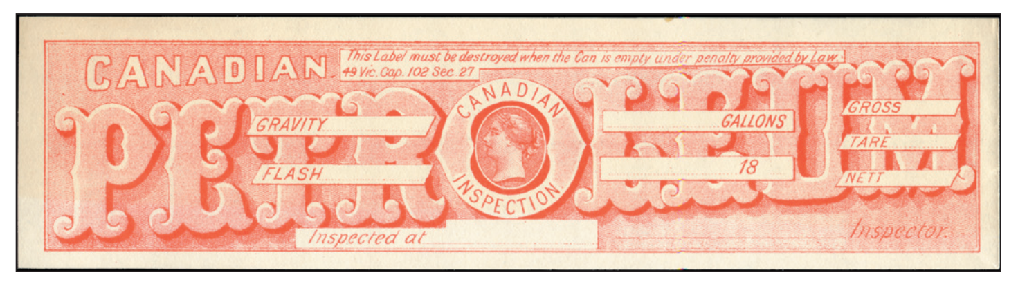
FPL11* - vermilion , imperf. Very Fine mint. Issued without gum. $225 (±US$180)