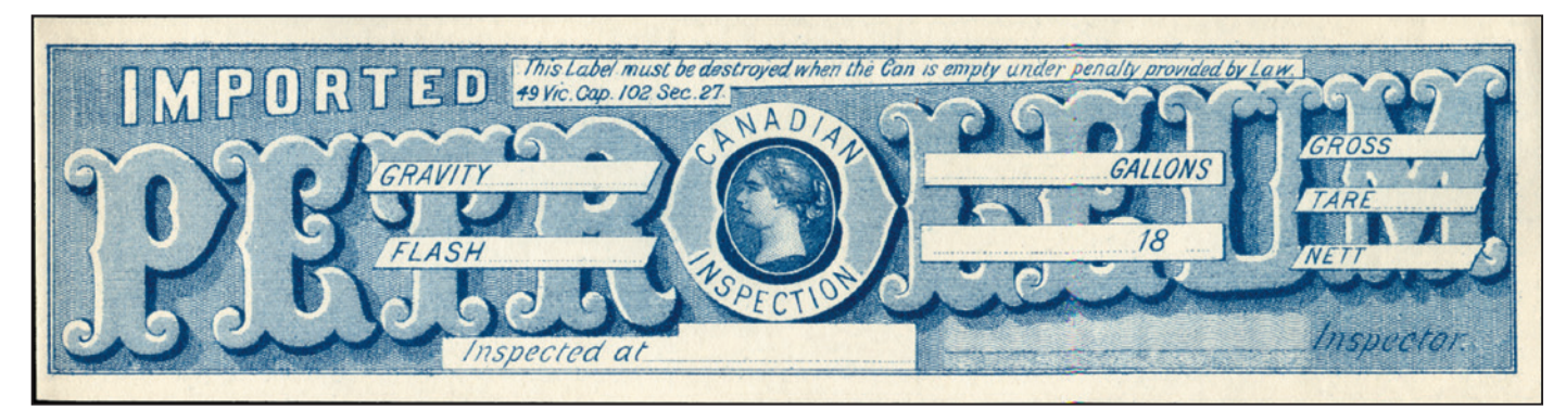
FPL12 * - blue, imperf. Very Fine mint. Issued without gum. $225 (±US$180)

BUY ALL 3 OF THE ABOVE PETROLEUM LABELS - FPL2, 11, 12 for only - $1250 (±US$1000)