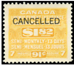
FU36s*NH - $1.82 yellow specimen. Cat $142.50 $100 (±US$80)