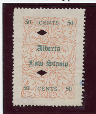
Pos. 10, Type D

Pos. 10 has perfs on all sides and break in "N" on lower CENTS