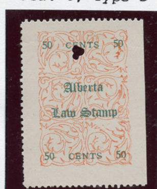
Pos. 9, Type E

Pos. 9 6th back ground block is broke: at top