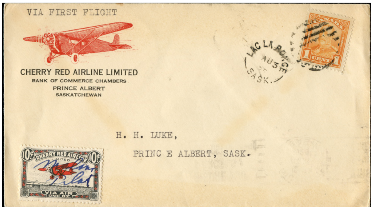
CHERRY RED AIRLINES - FIRST FLIGHT COVER Lac La Ronge to Prince Albert on official Cherry Red Airlines company cover. Proper August 3, 1929 Prince Albert backstamp. CL46-2902a - PILOT SIGNED - $99 (±US$79)