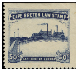
1922 CAPE BRETON LAW STAMP NSC15* - 50c blue VF mint, original gum. Very Rare. $300 (±US$240)