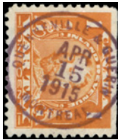
FWT7 - 1c War Tax with Rare bulls eye cancel Fabulous $25 (±US$20)