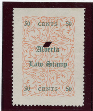
Pos. 2, Type D

Pos. 2 has no clipped Serif on "N", top CENTS