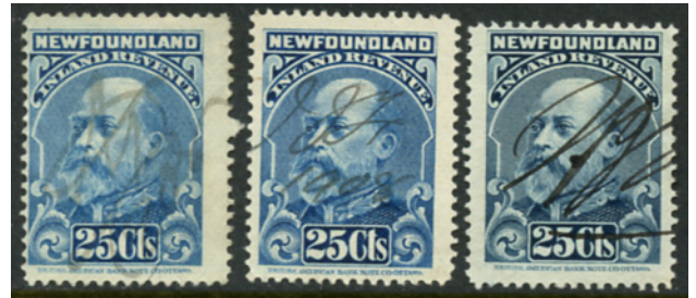
NFR10 - 25c blue x 3 different distinct shades - $25 (±US$20)