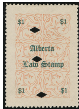
AL15L - $1 Fancy "L", VF used - $30 (±US$24)

Sign up to our FREE electronic mailing list on main page of our website, be sure to confirm you subscription upon receipt of confirmation email from our website. To ensure receipt of our email notices please add... news@canadarevenuestamp.com ... to your approved address book/contact list