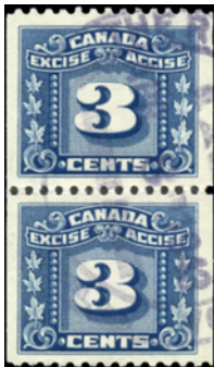
FX96a - VF used 3c coil pair. Rare this nice $25 (±US20)