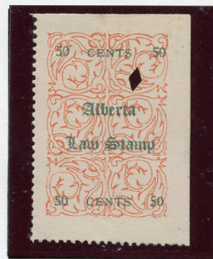
Pos. 3, Type D

Pos. 4 is perforated on left and has no damaged "O" at lower left