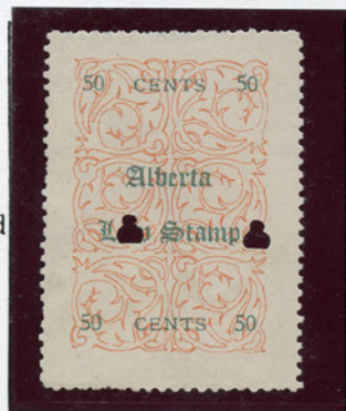
Pos. 7, Type D

Pos. 8 has clipped Serif on "N" on top CENTS