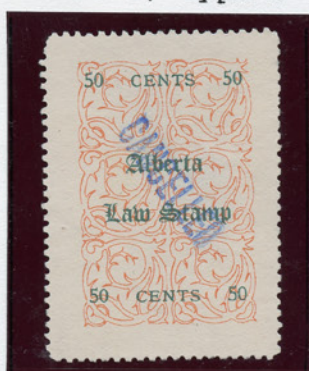
Pos. 8, Type A

Pos. 8 has clipped Serif on "N" on top CENTS