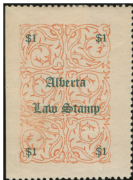
AL15* - $1 VF mint, part o.g. Exceptional $70 (±US$56)