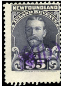
NFR21a - $5, perf. 11 very fresh. scarce perf. cat $75. $40 (±US$32)