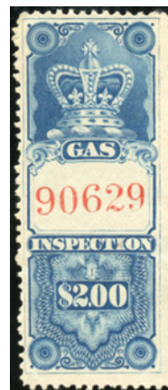
1875 GAS INSPECTION Rare FG13 - $2.00 blue. Fresh unused, no gum - $400 (±US$320)