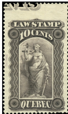
QL32 - 10c with partial imprint at top. Just a trace of a cancel. Imprints are very rare. $35 (±US$28)