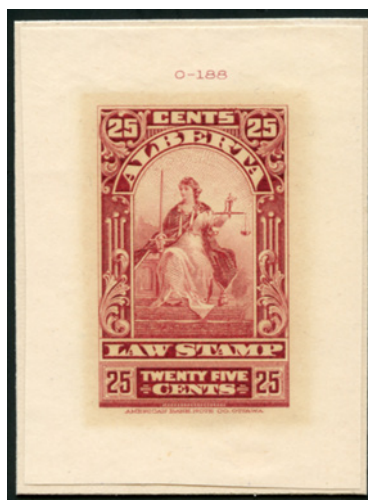
AL30 - 25c LARGE DIE PROOF on card. Very Fine $495 (US$395)