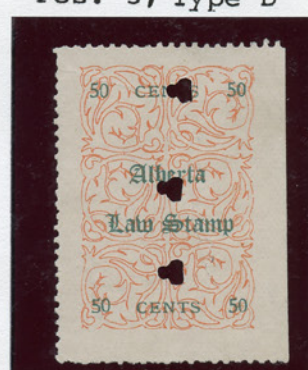
Pos. 6, Type D