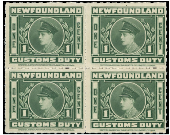
1925 Newfoundland Customs Duty - VARIETY BLOCK OF 4 NFC1,a *NH Block of 4 showing Roulette varieties. Spectacular Showpiece. VF*NH. Cat $1200. $600 (±US$480)