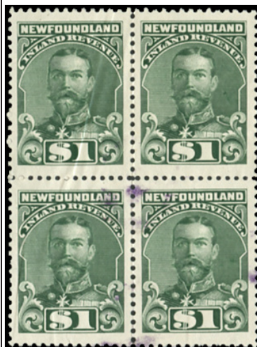
NFR25 - $1 green Scarce Block of 4. Document folds. Nice clean appearance. Cat. $70. $25 (±US$20)