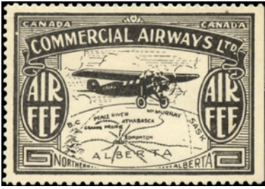
COMMERCIAL AIRWAYS CL48* - VF* o.g. - $12 (±US$10)