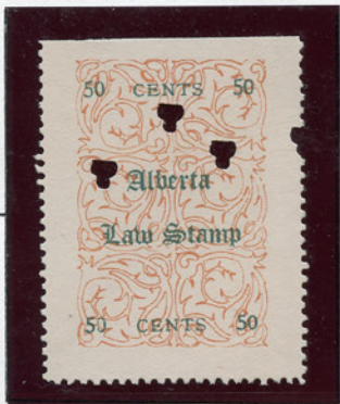
Pos. 1, Type D

Pos. 1 is perforated on left and has a damaged "O" at lower left