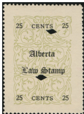
AL10L - 25c Fancy "L" in "LAW" VF used $170 (US$136)