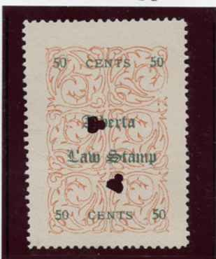
Pos. 5, Type C