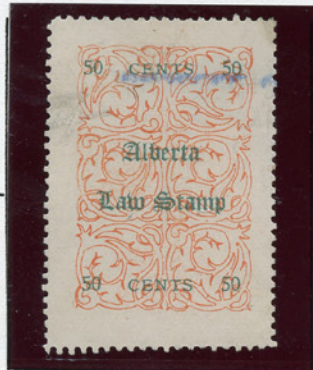
Pos. 4, Type D

Pos. 4 is perforated on left and has no damaged "O" at lower left