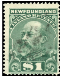
NFR12 - $1 Fine used $15 (±US$12)