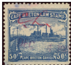
1904 CAPE BRETON LAW STAMP NSC13 - 50c blue. Lovely fresh copy. Rarely offered $250 (±US$200)

For much of the summer we have been under a threat of a postal strike, this is still a possibility until the postal union settles with the post office. If a strike appears imminent we will hold all mail until regular postal service returns.