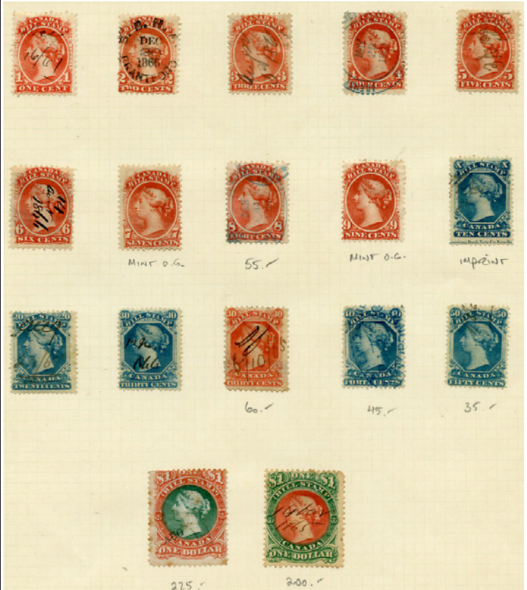
1865 SECOND BILL ISSUE