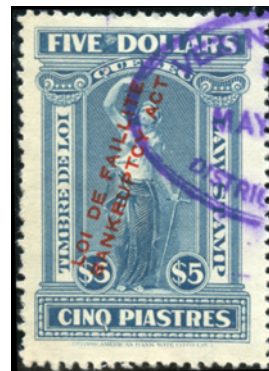
1923 QUEBEC "LOI DE FAILLITE" Rarely offered $5 blue QL108 - $150 (±US$120)