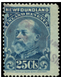
NFR10 - 25c blue VG used - $6 (±US4.80)