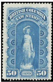
1879 British Columbia BCL3 - 50c blue scarce unused, no gum. IT61#39 - $35 (±US$28)