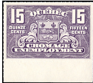
QU3* - 15c BOOTLEGGER FORGERY. rouletted. SUPERB unused, no gum IT61#45 - $100 (±US$80)