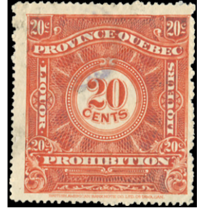
QP6 - 20c perf 10 1 / 4 unusually nice used copy IT61#55 - $40 (±US$32)