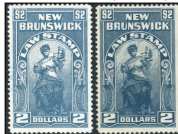
1940 New Brunswick NBL17 - $2 blue. light blue & dark blue shades. Very distinct IT61#52 - $50 (±US$40)