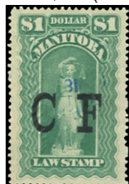
1877 Manitoba ML11 - $1 Very Fine centered for this IT61#48 - $10 (±US$8)