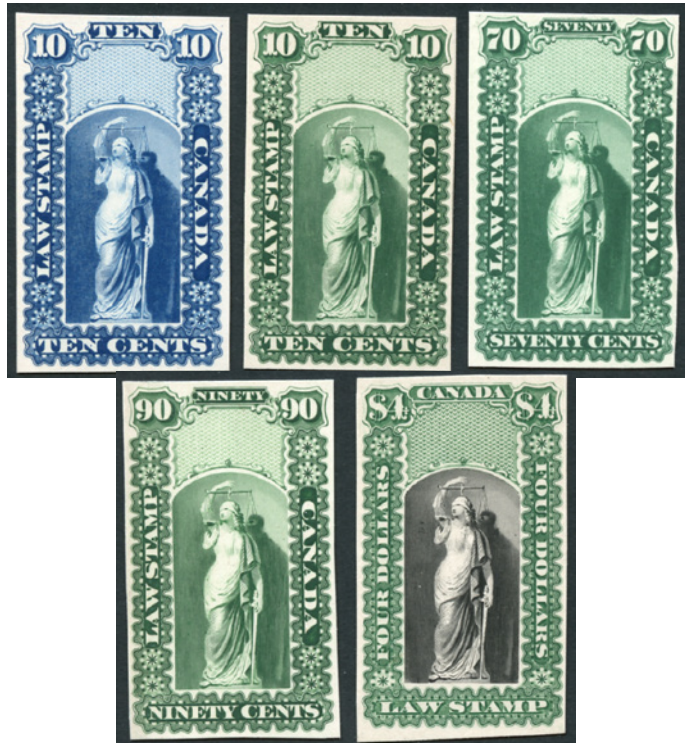
1864 ONTARIO PROOFS on india paper on card 5 different IT61#5 -- $125 (±US$100)