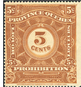
1919 Quebec Prohibition QP3* - 5c p.10 1 / 4 almost *NH. Cat. $20 IT61#53 - $12 (±US$9.60)