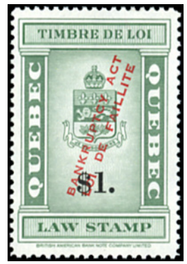
QUEBEC QL119*NH - $1 overprinted "Bankruptcy Act - Loi de Faillite" Cat. $75 IT61#21 - $30 (±US$24)