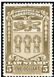
1938 Saskatchewan SL54*NH - $5 mint never hinged. Rare thus IT61#43 - $75 (±US$60)