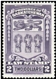
1938 Saskatchewan SL52*NH - $2 mint never hinged. Rare thus IT61#42 - $55 (±US$44)