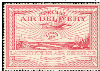
CL3* - Laurentide Air Service. light natural horizontal gum bends at top. hinged. Cat $135. IT61#47 - $75 (±US$60)