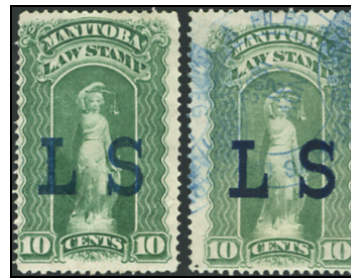
1877 Manitoba ML1 - 10c x 2 copies. blue & dark blue "L S" both - IT61#49 - $15 (±US$12)