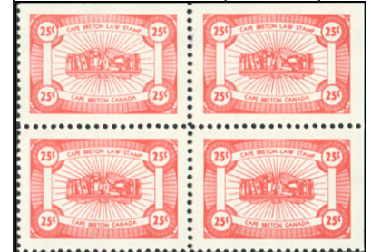
NOVA SCOTIA CAPE BRETON LAW. NSC16*NH - 25c red VF*NH U.R. corner block of 4. Cat $90 IT61#56 - $59 (US$47)