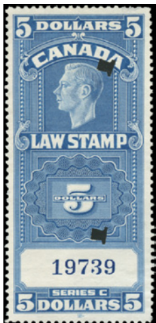
FSC26 - $5 milky blue. Cat. $55 IT61#8 $35 (±US$28)