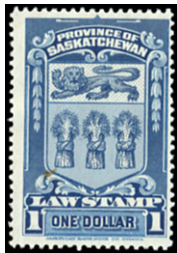
1938 Saskatchewan SL51* - $1 original gum, Rare thus - IT61#41 - $35 (±US$28)