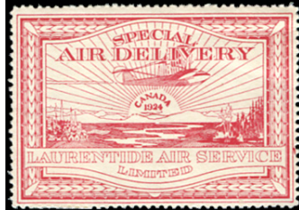
CL3* - Laurentide Air Service. light natural horiz. gum bends at top. heavy hinge. Cat $135. IT61#46 - $65 (±US$52)