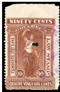
1912 QUEBEC UNLISTED QL64a - 90c IMPERF AT TOP small faults. Only one I have seen IT61#44 - $150 (±US$120)