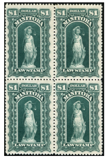
Manitoba - ML113a* - $1 blue green Block of 4. 2 stamps are Mint Never Hinged. Manitoba multiples rarely seen. Cat. $270. IT61#20 - $179 (±US$143)

Join our electronic MAILING LIST. Know right away about new pricelists Sign up directly on our website. Be sure to confirm your subscription when you receive the automated confirm message from our website.