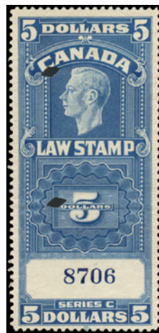
FSC26b - $5 dark blue, off-white paper. usual fold IT61#10 $50 (±US$40)