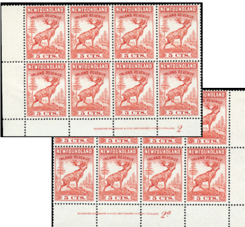
NFR46*NH - 5c red 1966 Newfoundland Caribou issue. 2 different Imprint & plate number blocks of 8. One plate "2", other is plate "2a". IT61#17 - $50 (±US$40)