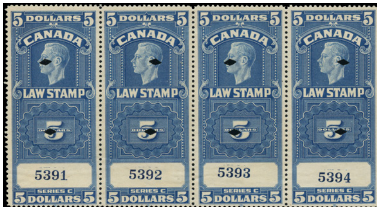
FSC26b - $5 dark blue, off-white paper. Rare strip of 4. Catalog value as singles $300 and much more as a multiple. Lovely item - IT61#11 - $210 (±US$168)