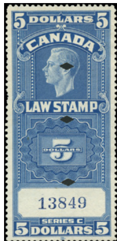
FSC26 - $5 dark blue, white paper. short perf at left IT61#9 $35 (±US$28)