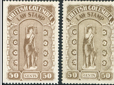
BCL25* - 50c brown 2 shades, VF unused, no gum - IT61#50 - $18 (±US$14.40)