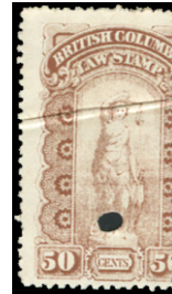
BCL7 - 50c PERF FREAK. Very unusual narrow stamp. Document crease IT61#51 - $35 (±US$28)