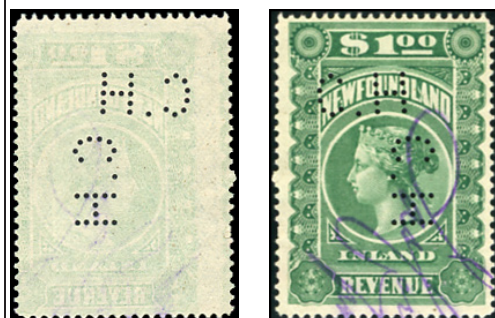
NEWFOUNDLAND NFR6 - $1 green with normal & sideways "C.H" PERFIN. Front & back shown. IT61#6 $50 (±US$40)