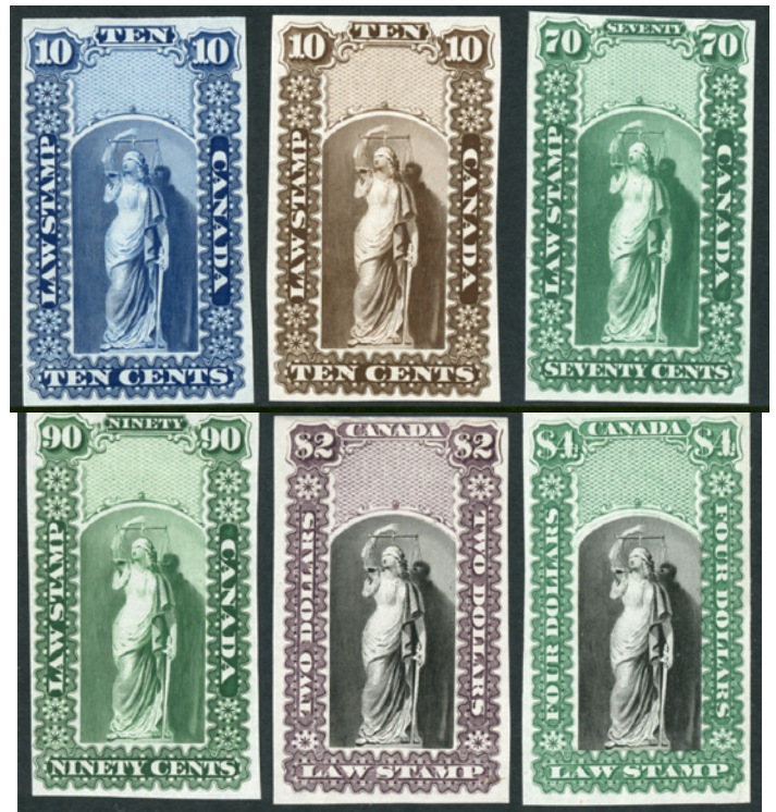
1864 ONTARIO PROOFS on india paper 6 different IT61#4 - $150 (±US$120)

WWII WAR SAVINGS CERTIFICATE in FRENCH. This one is very unusual, because it is in French only - rarely seen thus. Affixed FWS7, 8, 9, 10, 11, 12, 14. Just the stamps catalogue $97.50 + value of very scarce form. Nice condition for this - IT61#3 - $65 (±US$52)