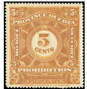
QP3* - 5c VF perf 10 1 / 4 , almost *NH IT61#54 - $20 (±US$16)